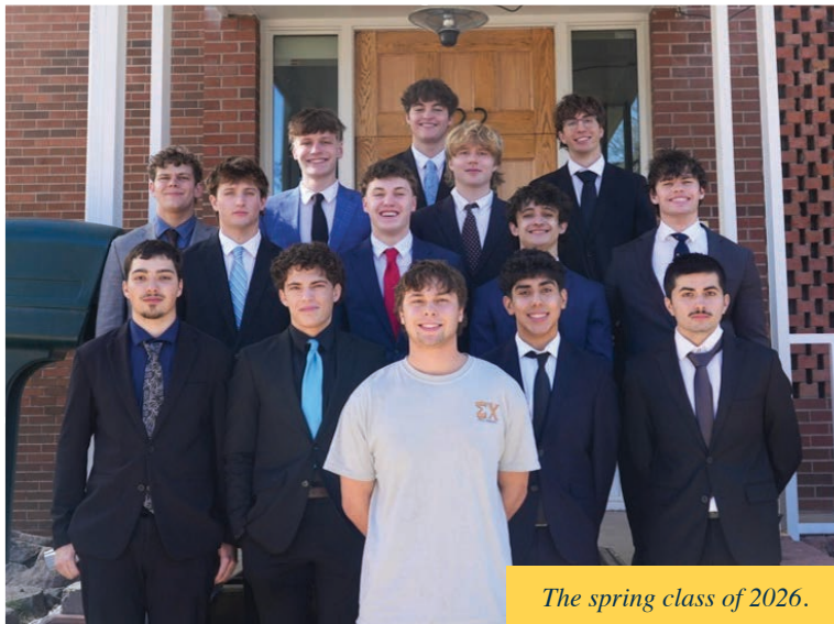
The spring class of 2026.