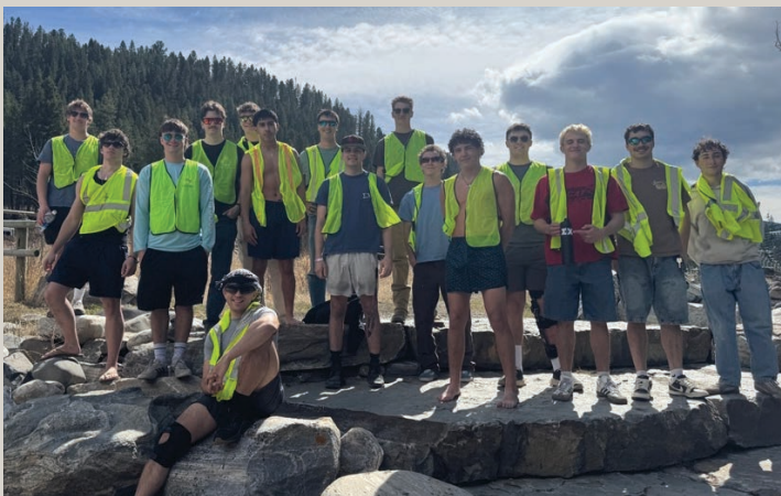
Beta Rho gathers for our annual highway trash cleanup.