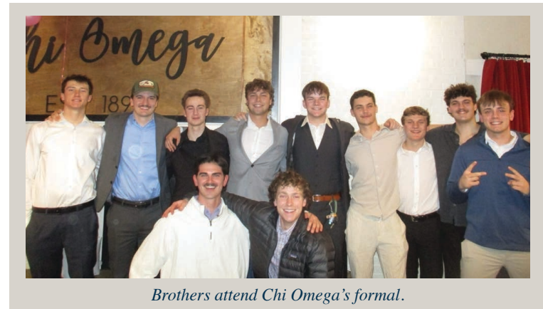
Brothers attend Chi Omega's formal.

Beta Rho has remained actively engaged in serving the local community. From our semesterly highway cleanup in the Gallatin Canyon to volunteering at Fork & Spoon in Bozeman, as well as hosting a Red Cross blood drive at the chapter house, our members have consistently shown up to give back. These efforts reflect our commitment to making a positive impact and strengthening community relationships.