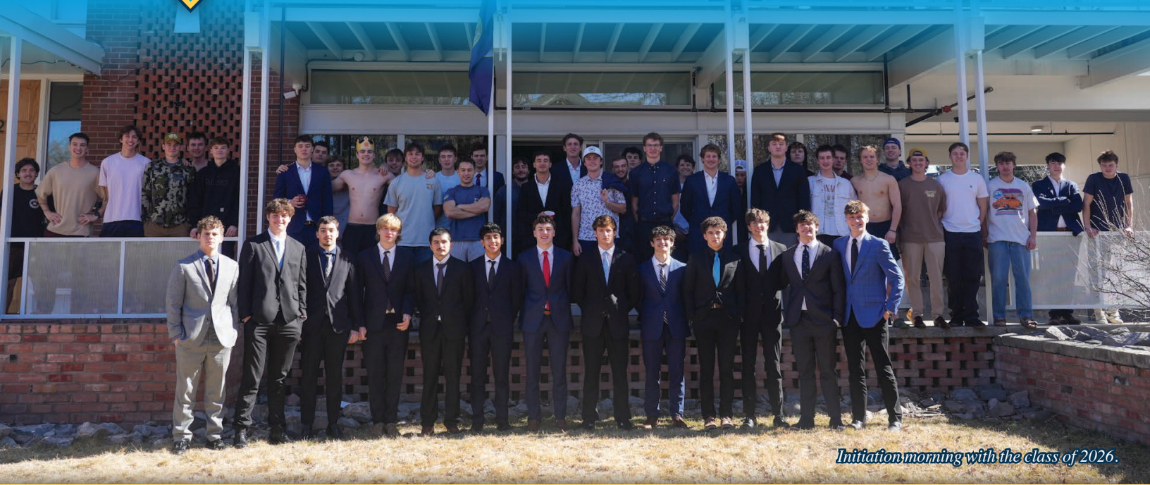
Initiation morning with the class of 2026.

THE BETA RHO CHAPTER OF SIGMA CHI FRATERNITY MONTANA STATE UNIVERSITY