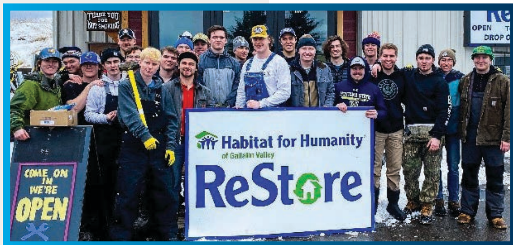
Brothers working hard at the Habitat for Humanity Restore in Belgrade.

To reconnect with brothers and view the alumni directory, sorted by graduation year, go to bobcatsigs.org/alumni/alumni-directory . The generic password is betarho1917.