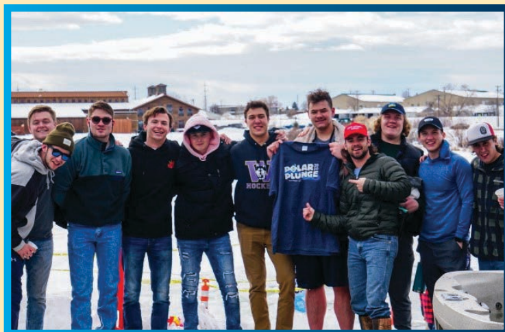
Active members took part in the Bozeman Polar Plunge to support Special Olympics Montana by taking an icy dip into Glen Lake.