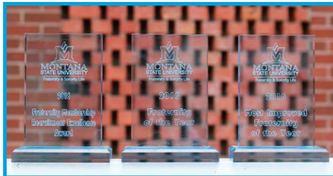
Beta Rho received the Fraternity of the Year, Most Improved Fraternity, and Best Fraternity Recruitment awards at the 2016-17 Greek Awards Banquet.

The success of today's chapter is easy to see. This spring they had the honor and distinction of winning Fraternity of the Year, Fraternity Membership Recruitment Excellence, and Most Improved Fraternity of the Year at the Montana State University Fraternity & Sorority Life awards. Beta Rho Chapter has also earned four J. Dwight Peterson