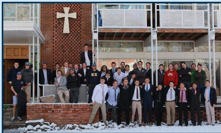
We are very proud of our undergraduate brothers and their many accomplishments!