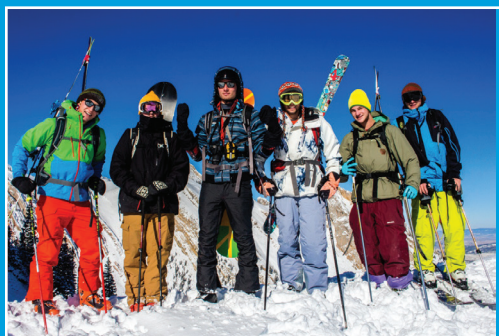
Brothers hike up Frazier Basin past Bridger Bowl for some early season skiing this winter.