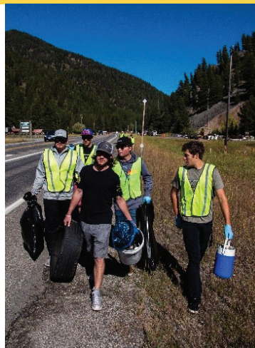
Brothers clean up our adopted two-mile stretch of Big Sky Highway.