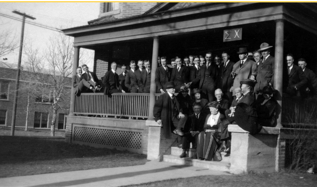
Sigma Chi members on the porch of their house, 1921