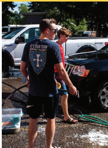
Brothers at our biannual philanthropy car wash at the chapter house.