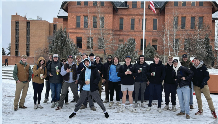
Brothers host a coffee/hot chocolate giveaway on campus.

This fall, we were placed on social probation with MSU and have been working to ensure that we continue to follow the ideals laid out by our founders. Together with our administration, we have revamped our risk management policies, will work closely with our Chapter Advisor and Grand Praetor regarding future social events, and will continue to ensure that the lessons from Preparation for Brotherhood (P4B) carry forward into active membership.