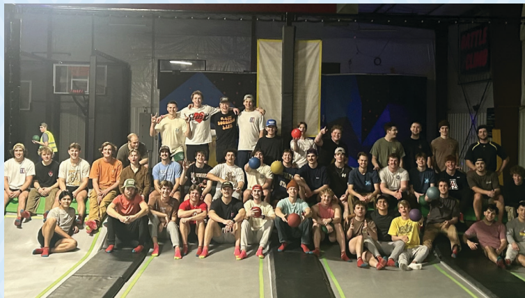
Members gather for a brotherhood event at JumpTime in Bozeman.