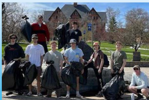
Our results of looking for trash around campus after graduation.