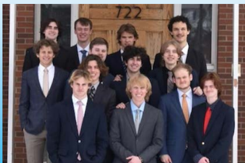
The newest class of initiates on the morning of their initiation.