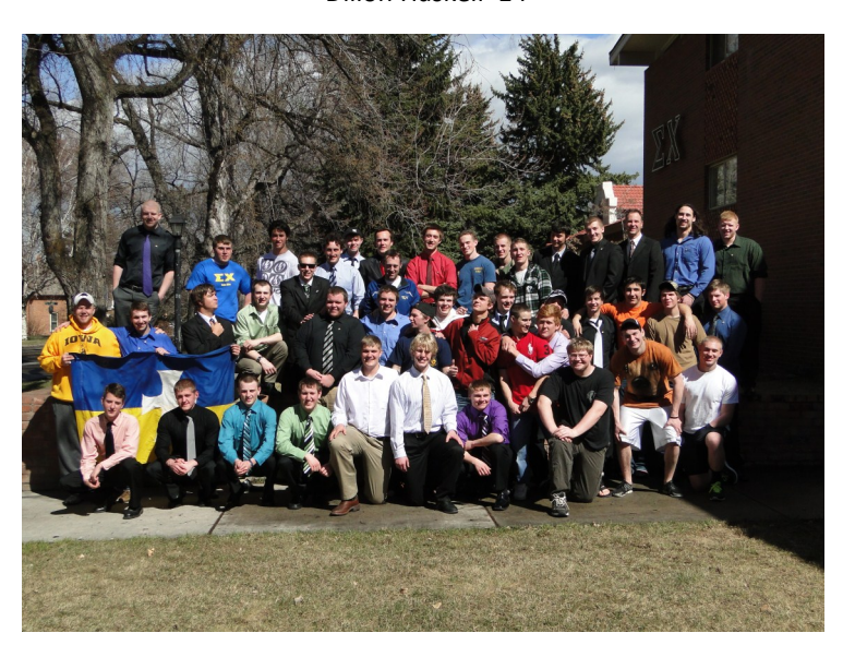
The active chapter out front of the house following our spring initiation.